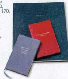
▶ SMYTHSON Brunches, Lunches, Suppers, Dinners book, $80; Interior Design Notes, $75; Partobella Diary, $375; smythson.com