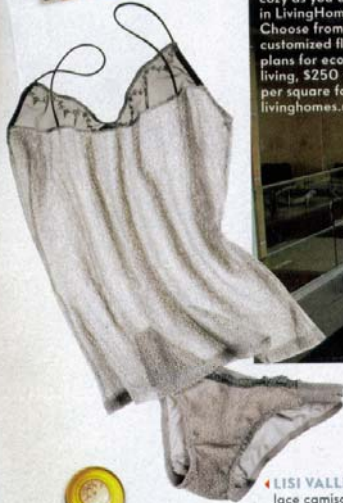
▶ LISI VALLE Sophie lace camisole, $120, lace bikini panties, $70, figleaves.com