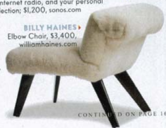
▶ BILLY HAINES Elbow Chair, $3,400, williamhaines.com

PHOTOGRAPHS BY JEFF HARKES (BOOKS, BOWLS, BRACELET, CLUTCHES, LINGERIE); PENDANT, VOTIVES); FOR DETAILS, SEE CREDITS PAGE