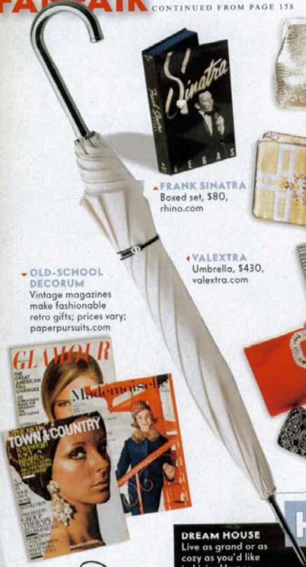
▶ FRANK SINATRA Boxed set, $80, rhino.com