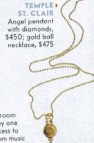
▶ TEMPLE ST. CLAIR Angel pendant with diamonds, $450; gold ball necklace, $475