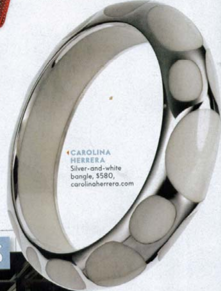
▶ CAROLINA HERRERA Silver-and-white bangle, $580, carolinaherrera.com