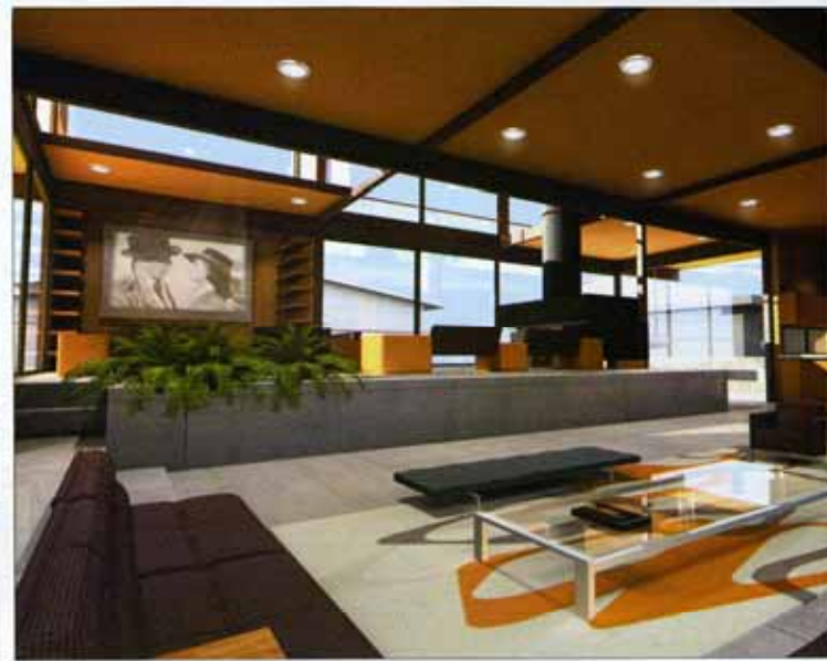
Renderings (above and left): Courtesy LivingHomes