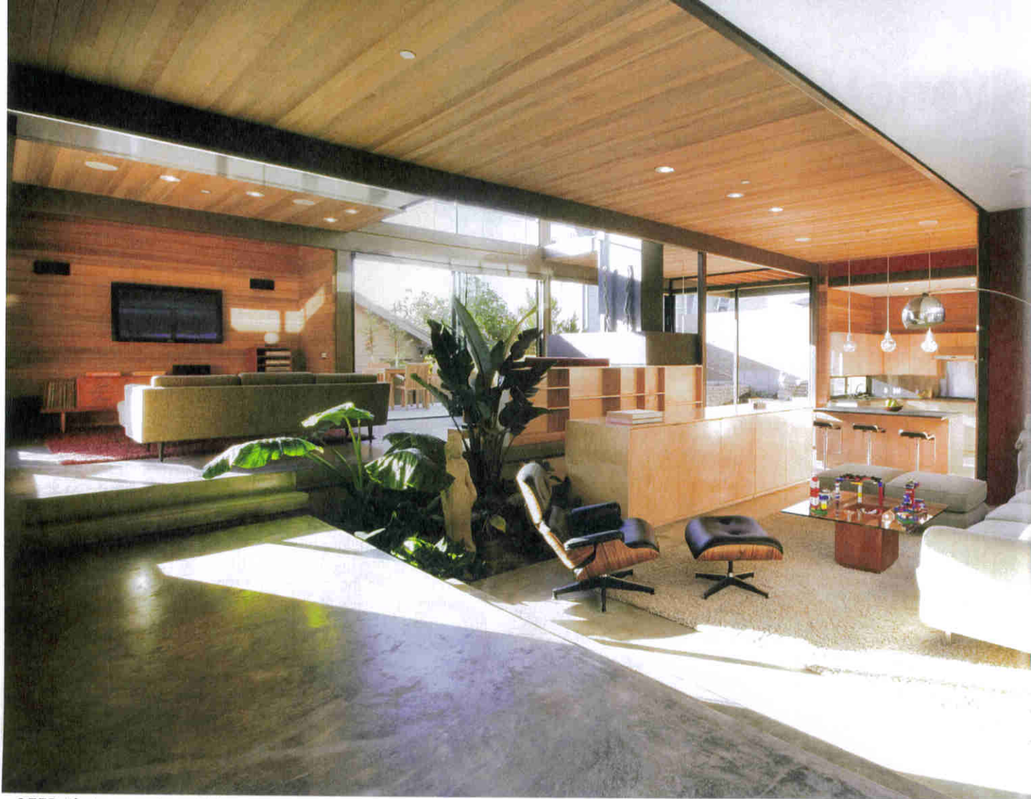
LEED Platinum rated pre-fab home; a LivingHomes living room